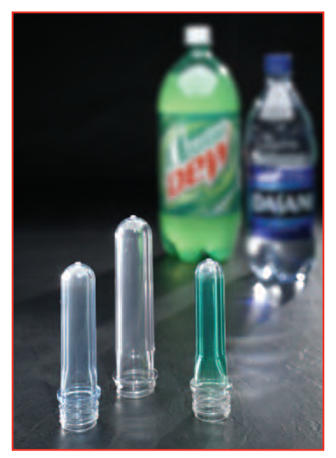
For more than 50 years Watlow has provided thermal solutions for plastic applications.

Whether you require high performance, high temperature, high watt density, or all of these, Watlow has the product to best fit your application: