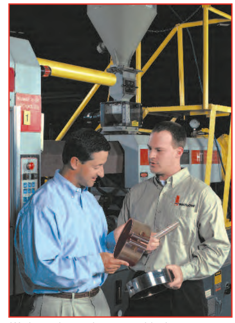
Watlow sales engineers provide the support plastic manufacturers need.

Watlow meets your thermal solution needs with our broad product offering, new technologies, engineering services and global manufacturing capabilities.